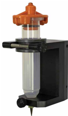
Time Pressure with 10 cc Syringe

Syringe sizes from 5 cc to 30 cc may be used with the included syringe kit.