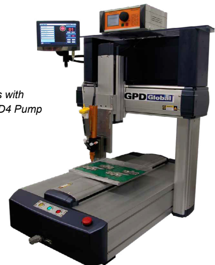
Island 3S4 Series with GPD Global® PCD4 Pump and Controller

The Island Series is designed to be an accurate, reliable platform for complex-to-simple dispensing tasks. Each system is built to last with its high quality materials and can be easily adapted to other applications or dispense pumps.